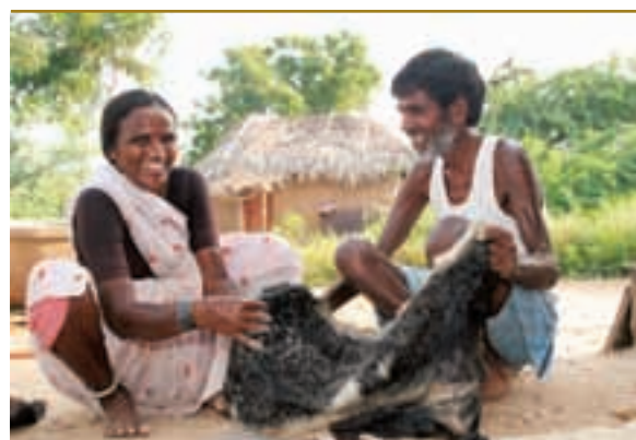
There is a gradual change in gender relations